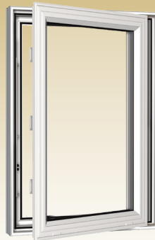
CASEMENT Pro8100 Case & Twins