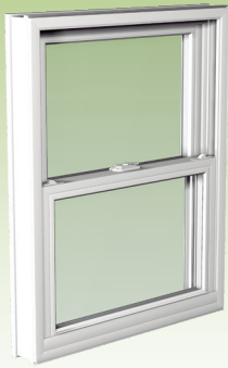
DOUBLE HUNG Pro200

This warranty set forth is Window Factory Outlet, Inc's maximum liability for its products. Window Factory Outlet shall not be liable for special, indirect, consequential or incidental damages. Your sole and exclusive remedy with respect to any and all losses or damages resulting from any cause whatsoever shall be as specified above. Window Factory Outlet makes no other warranty or guarantee, either expressed or implied, including implied warranties of merchantable and fitness for a particular purpose to the original purchaser or any subsequent use of the product, except as expressly contained herein. In the event state law precluded exclusion or limitation of implied warranties, the duration of any such warranties shall be no longer than in the time and manner of presenting any claim thereon shall be the same as that provided in the express warranty stated herein. No distributor, dealer or representative of Window Factory Outlet has the authority to change, modify or expand this warranty. The original purchaser of this product acknowledges that they have read this warranty, understand it and are bound by its terms.